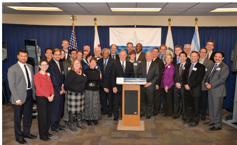
The CAPriCORN team stands with Illinois elected officials at a recent press conference.

To achieve these tasks, the group has begun to standardize a set of electronic health record data (a common data model) across all of the CAPriCORN institutions, which include Rush University Medical Center, University of Chicago Medicine, Cook County